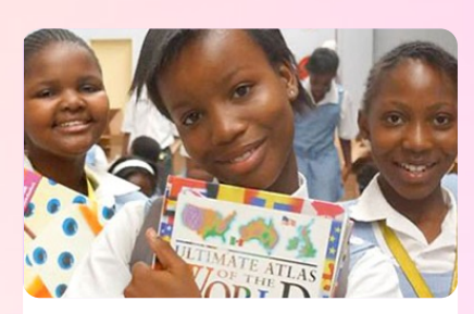
Providing Books to Africa