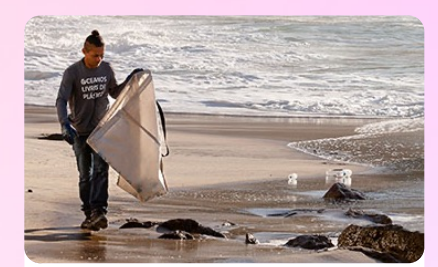
Preventing Ocean Bound Plastic