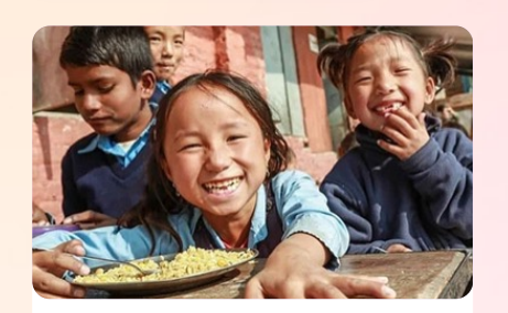
Feeding People in Need